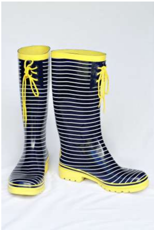
'Abby' wellies, $150

With the winter downpour we've been experiencing recently, it's high time we splash out on some decent gumboots. Priced from $90 to $150, Rosie Roo Designer Wellies are pretty as a picture, and perfect for puddle-jumping. Why ruin your suede boots when these look just as good? Brighten up your life and keep your tootsies high and dry.